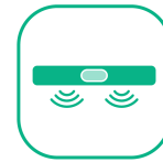
2*Speakers with Stereo Sound